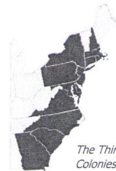
The Thirteen Colonies

England had a lot of other colonies besides those in America and plenty of other problems to deal with. The king and Parliament didn't have much time to pay attention to the American colonists. By the mid-1700s there were 13 colonies, and each colony had its own government. These little governments grew stronger and more used to being in control. When problems came up, the colonial governments took care of things themselves. The colonists were out on their own, making their own decisions, governing things the way they wanted to without much interference.